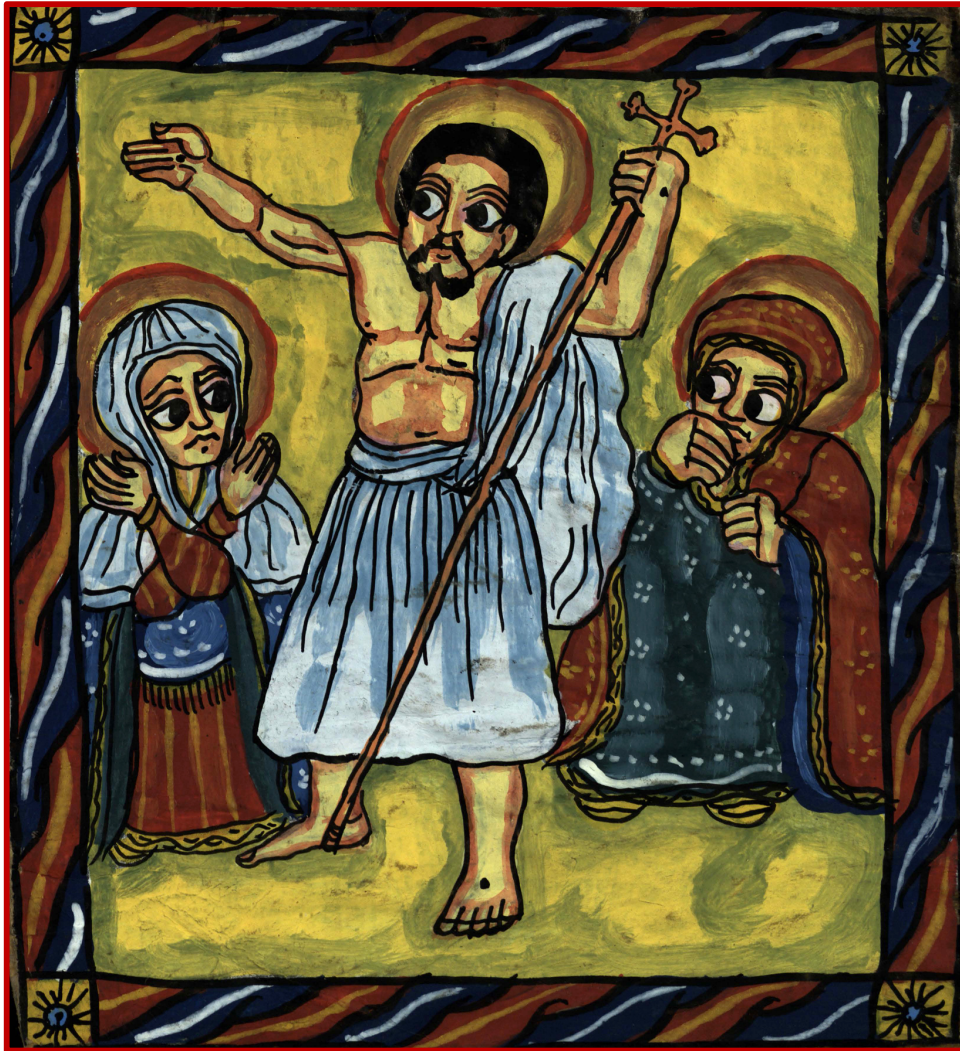
The Crucifixion from an 18th century Ethiopian psalter (St Andrews ms38900)